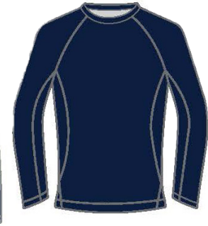
Baselayer Top - Climaskin