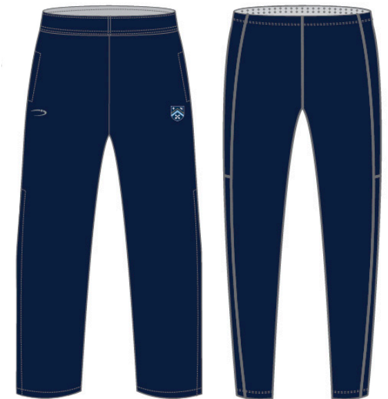
Training Pants Performatex, Polycotton Lining Unisex Fit