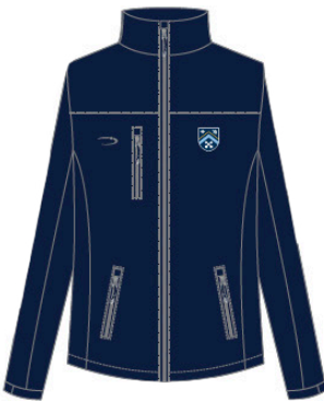
Active Jacket - Stormtex Unisex Fit