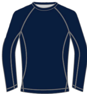
Baselayer Top - Climaskin