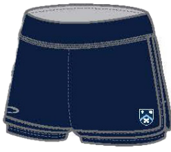
Running Shorts Performatex Lite and Climakin