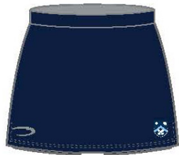
Skort Hydrocool Lite, with Climaskin Undershort