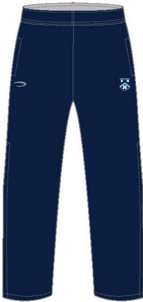
Training Pants Performatex, Polycotton Lining Unisex Fit