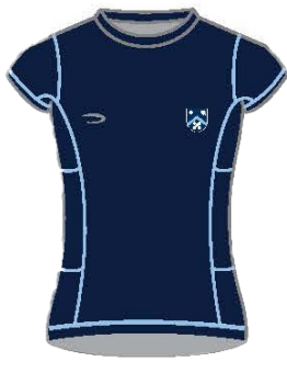
Fitness T-Shirt Hydrocool Smooth Girls Fit