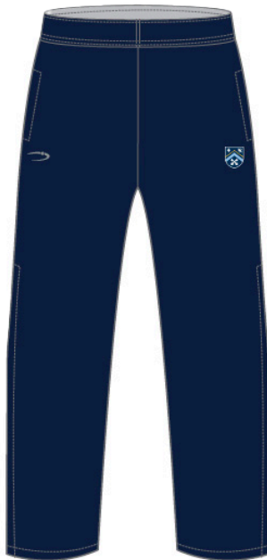
Training Pants Performatex, Polycotton Lining Unisex Fit