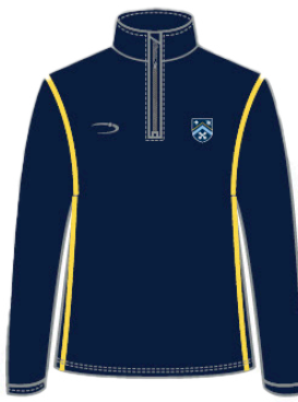
Midlayer - Thermotex Unisex Fit