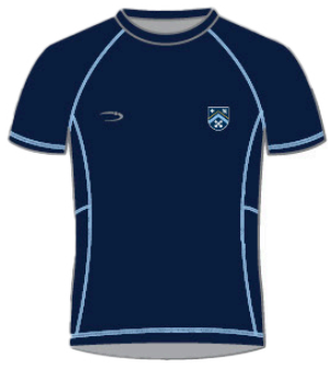
Fitness T-Shirt Hydrocool Smooth Unisex Fit