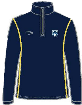
Midlayer - Thermotex Unisex Fit