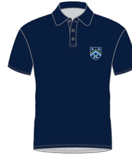
PE Polo Shirt (Navy)