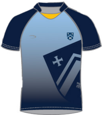
Games Shirt Unisex Fit