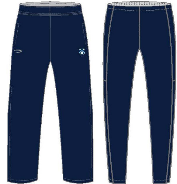
Training Pants Performatex, Polycotton Lining Unisex Fit