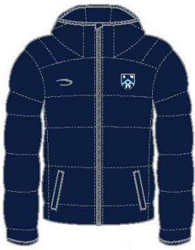
Heavyweight Puffer Jacket - Stormtex