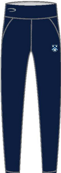
Fitness Leggings Climaskin Xtra