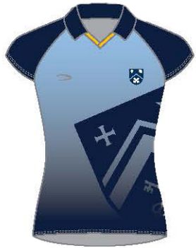
Games Shirt Girls Fit