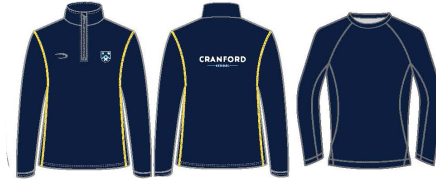
Midlayer - Thermotex Unisex Fit