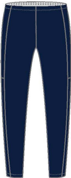
Baselayer Leggings Climaskin