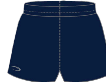
PE Shorts (Navy)