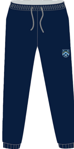
Jogging Bottoms (Navy)