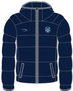
Heavyweight Puffer Jacket - Stormtex