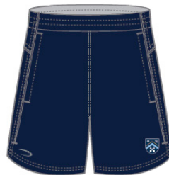
PE Shorts Performatex Lite, with Pockets