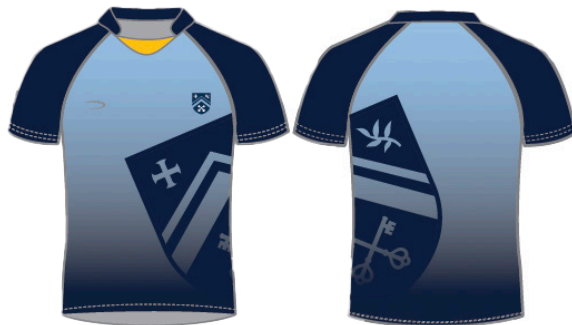
Games Shirt Unisex Fit