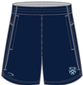
Senior PE Shorts Performatex Lite, with Pockets