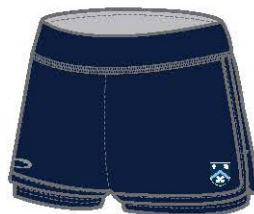
Running Shorts Performatex Lite and Climakin