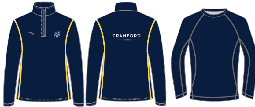
Midlayer - Thermotex Unisex Fit