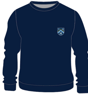
PE Sweatshirt (Navy)