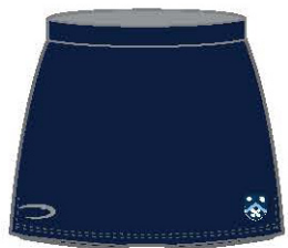
Skort Hydrocool Lite, with Climaskin Undershort