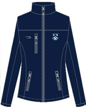
Active Jacket - Stormtex Girls Fit